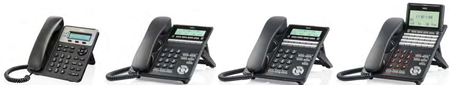
Mono: Easy call control from the office

For the full range of SV9100 handsets visit www.nec-enterprise.com for further details.