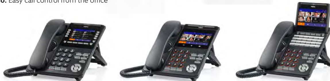
Colour: Easy call control from the office, remote or home-based working, hot-desking