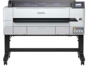
Epson SC-T5405 (LFP 1) Up to 0.5 ppm

Large-format printer for CAD applications, colour A0, 0.5ppm, 500 prints/month Media sizes and types supported: roll-fed A0 - A4, bond, coated and photo/glossy.