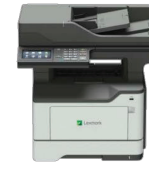
Lexmark MX521ade (MFP 2) Up to 44 ppm

Designed for small to medium businesses the A4 Mono MFPs print and copy in high-resolution B&W as well as scans and faxes in both colour and B&W