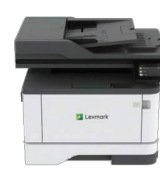
Lexmark MX431adn (MFP 1) Up to 40 ppm

Designed for small to medium businesses the A4 Mono MFPs print and copy in high-resolution B&W as well as scans and faxes in both colour and B&W