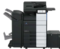
Itec C450i (MFPC 7) Up to 45 ppm

Offering a smart combination of features, technologies and investment for a competitive edge in business production printing. A modular system starting with entry-level hardware costs plus it features energy star awarded green technology.