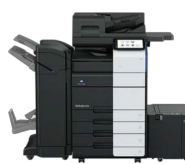
Itec C650i (MFPC 8) Up to 65 ppm

Offering a smart combination of features, technologies and investment for a competitive edge in business production printing. A modular system starting with entry-level hardware costs plus it features energy star awarded green technology.