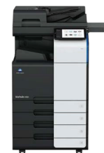
Itec B300i (MFP 6) Up to 30 ppm

Designed for small to medium businesses the A3 Mono MFPs print and copy in high-resolution B&W as well as scans and faxes in both colour and B&W.