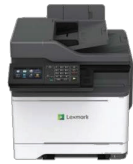
Lexmark XC522ade (MFPC 2) Up to 35 ppm

Designed for small to medium businesses the A4 Colour & Mono MFPs print and copy in high-resolution B&W as well as scans and faxes in both colour and B&W